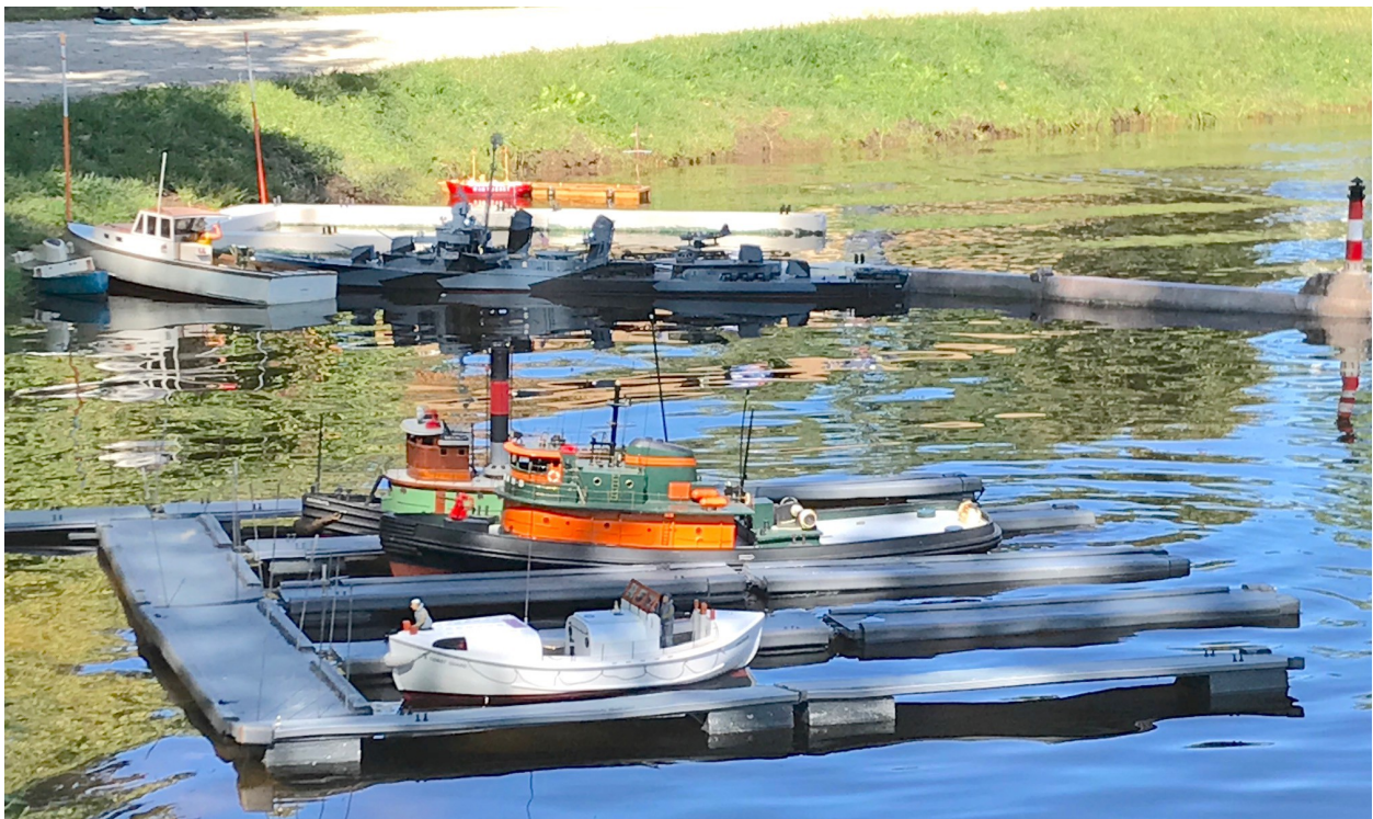
Below: Just a few of the many boats seen in the harbor area during the day.