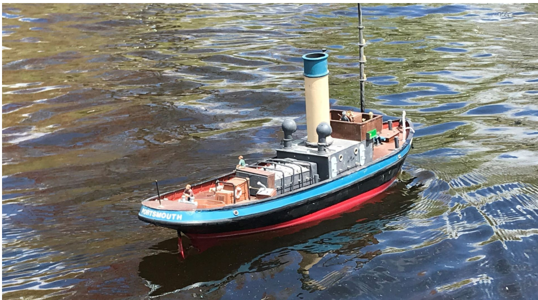
Charlie's tug Westbourne.