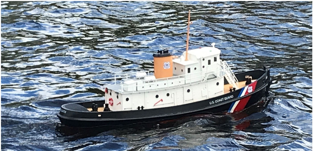
Shaun Kimball's tug Goliath.