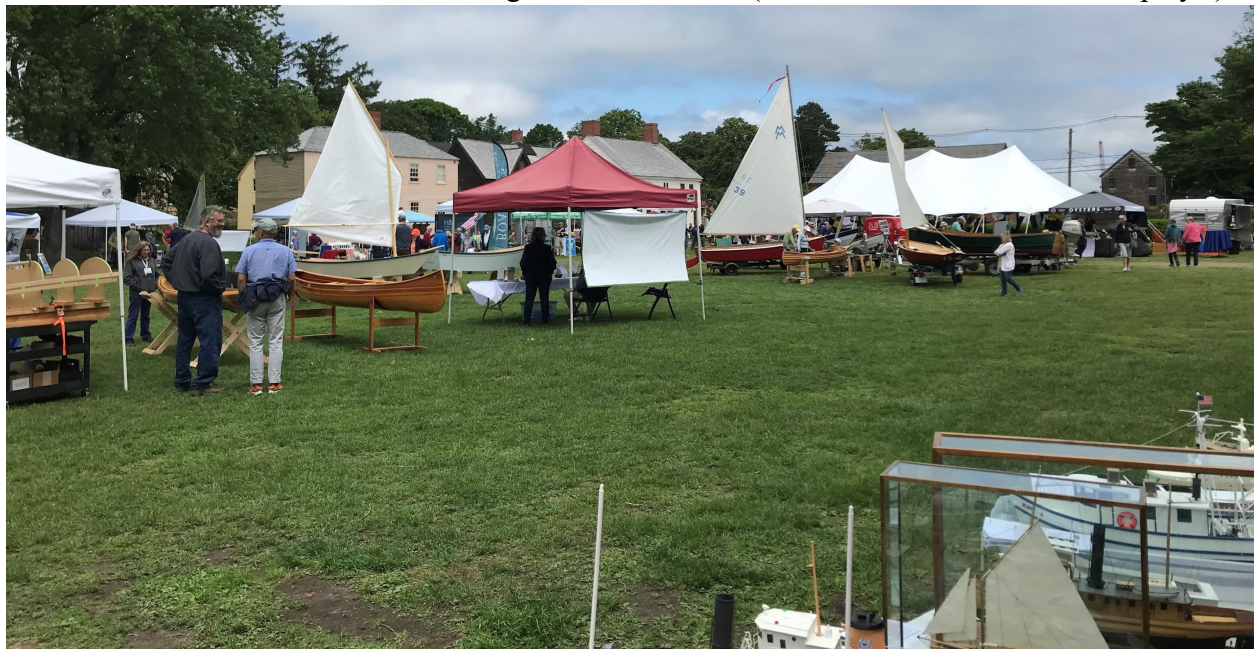
Below: The view from our table looking down the Green. (That's less than half of the displays.)