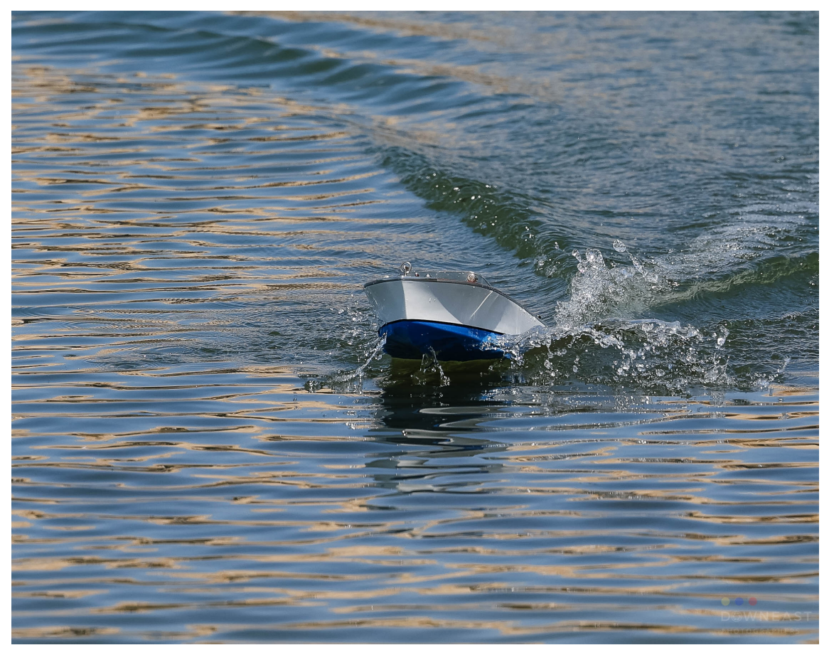
Above: Bob Prezioso's runabout at speed.