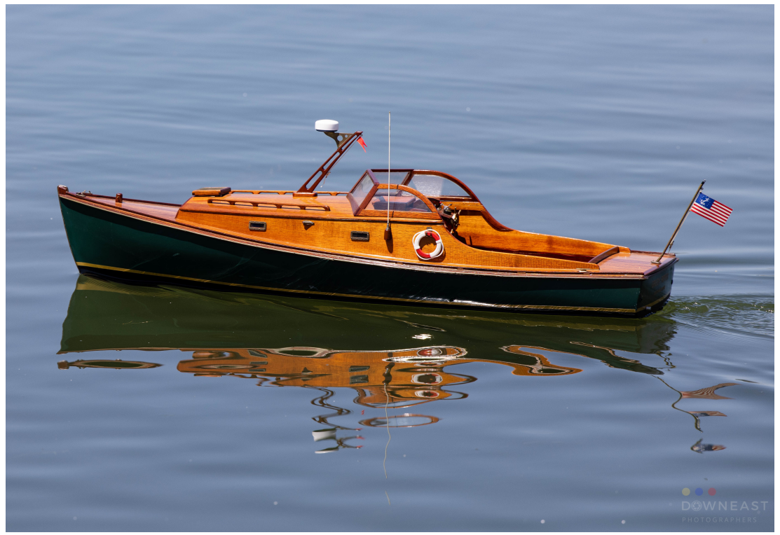
(Linda Arini's Green Ripper)

We did have an issue with the weeds-- in the 3 weeks between my last visit and the day of the event, the weeds had really blossomed. Skippers had to be careful to steer around the larger clumps. The consensus was that it is a great site, but July may not be a the right month in the future!